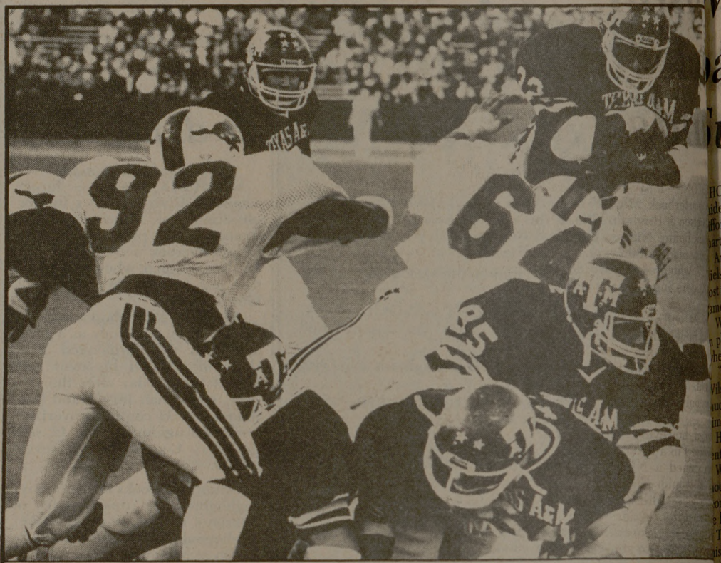
Preparing for lift-off

Both the Razorbacks and Bears own 3-2 league records and the loser will be out of the title picture. The loser also will be close to being removed from bowl consideration altogether.