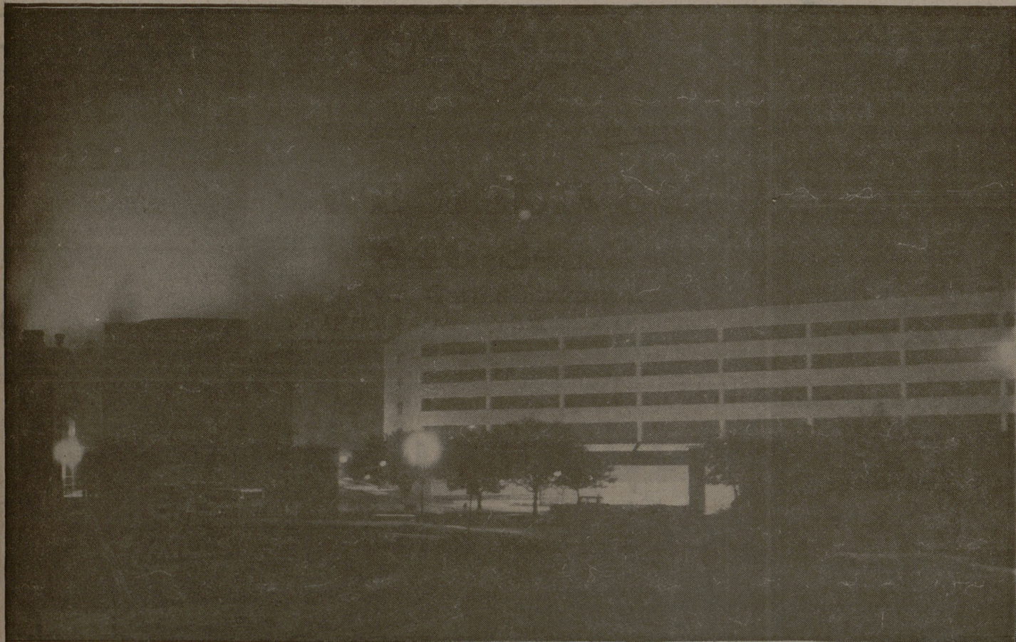
Early morning on campus