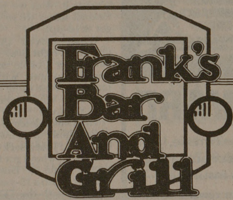
Plate Lunch Specials (Monday-Friday)