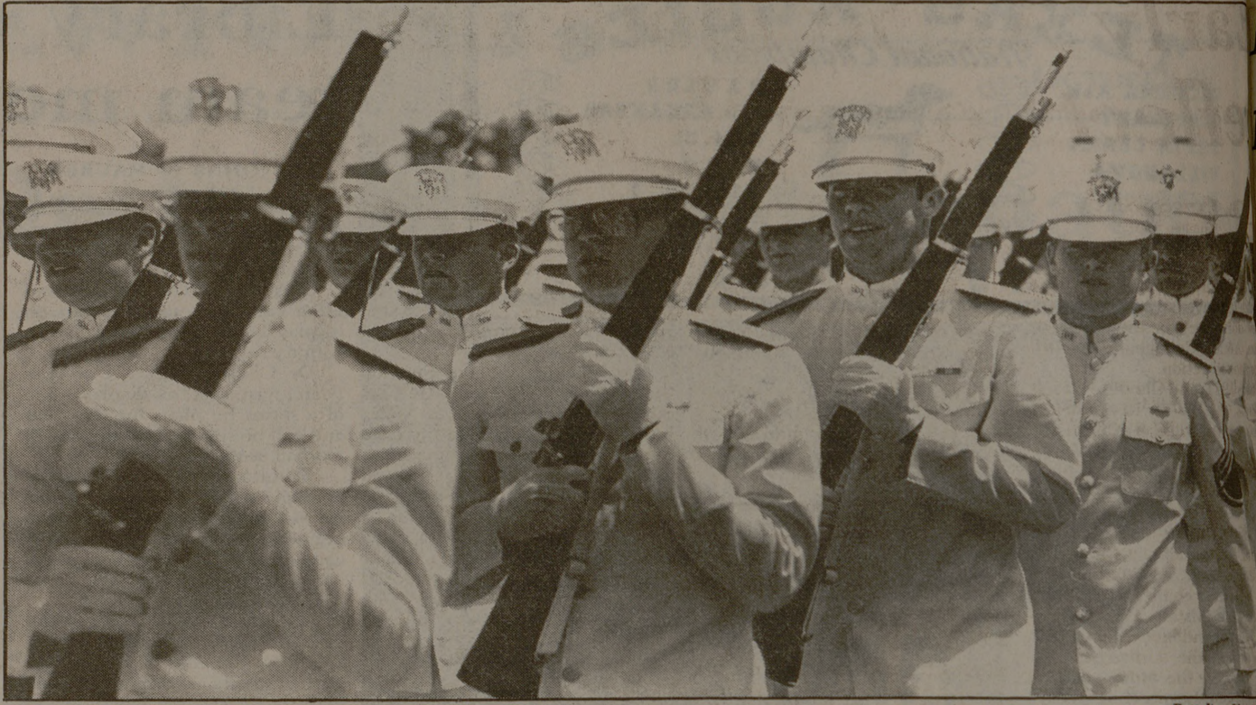
The Governor's men in white

The Ross Volunteers are conducting seminars throughout 1981-82 to improve their service to Texas A&M University.