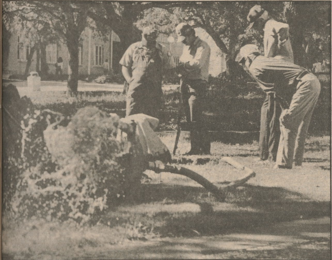
Working in the hole