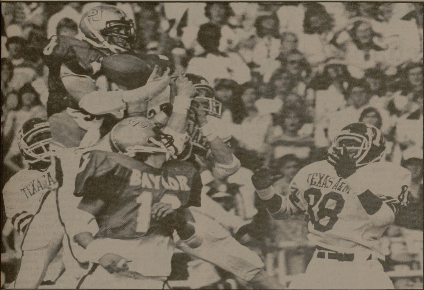
Last second traffic jam