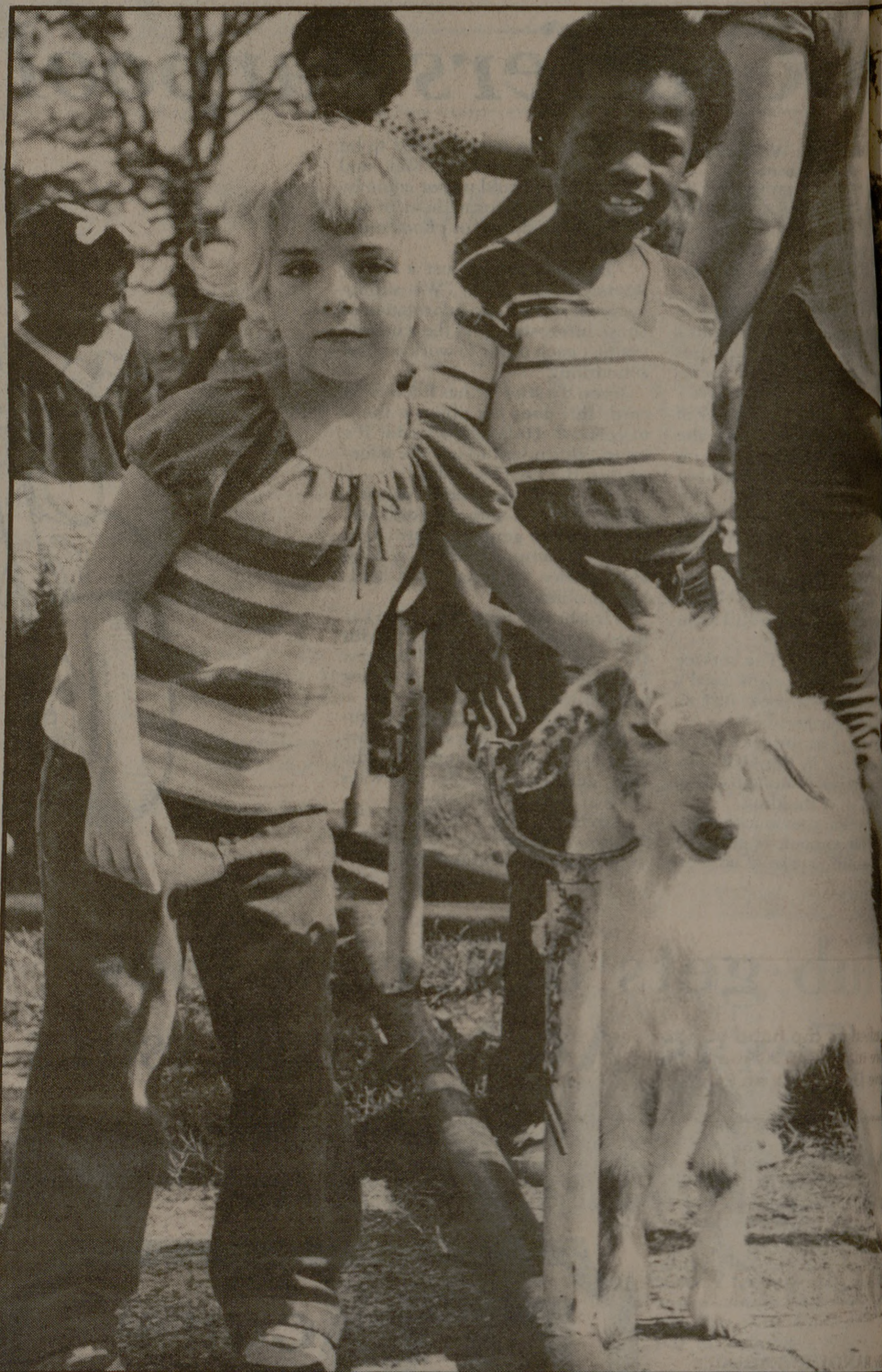
'Look Ma, I got a goat'