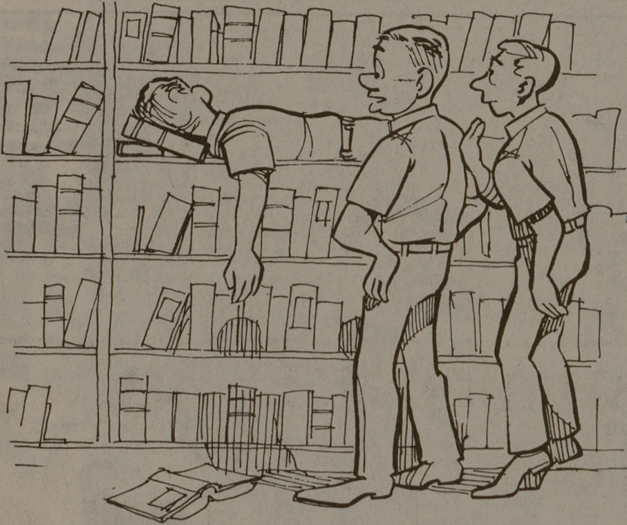
"I've never understood before why he liked to study in the library!"