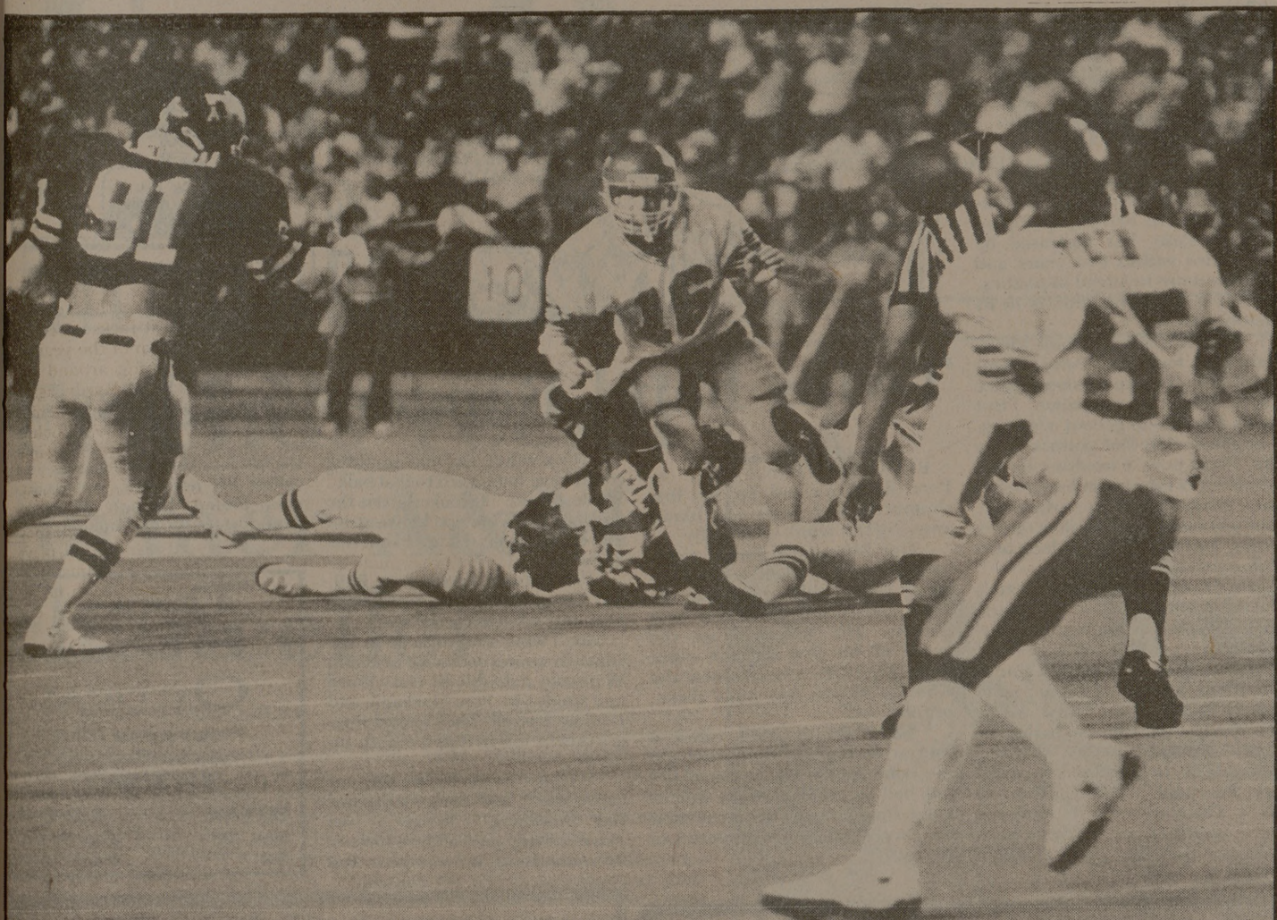
On the firing line