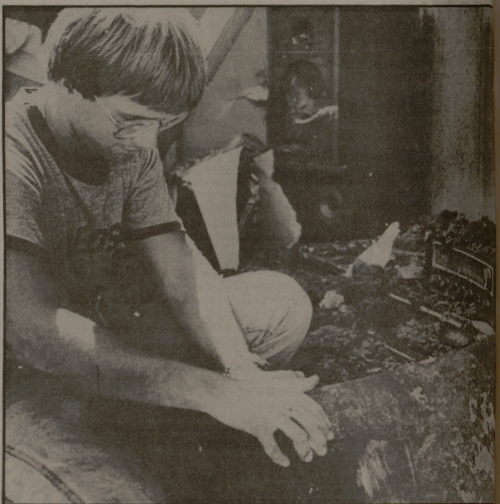
Fire damage surveyed