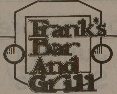
Plate Lunch Specials (Monday-Friday)