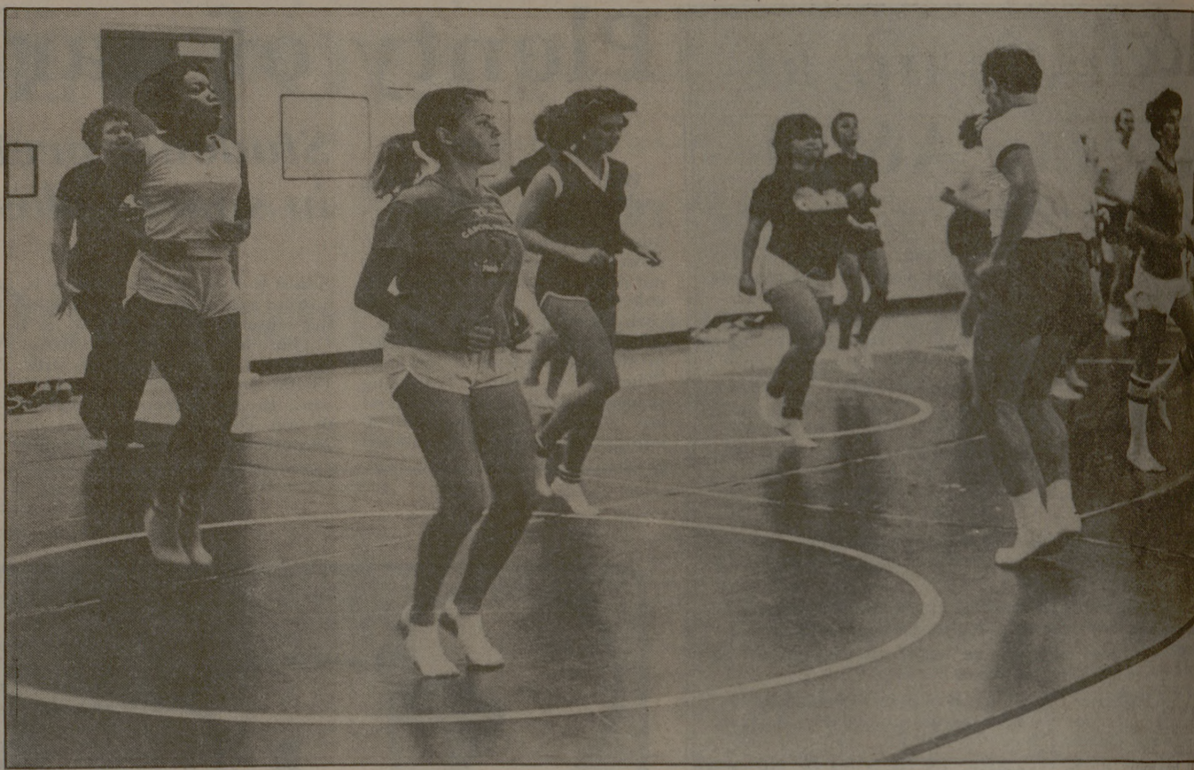
Participants in aerobic classes loosen up and stretch in preparation for other more rigorous exercises.

Higham said spaces are available in all of the classes except the evening aerobics. Cost of the classes is $35 for returning students and $45 for new students.