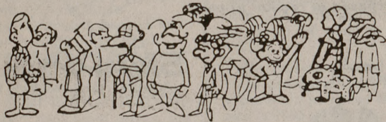
Day students get their news from the Batt.