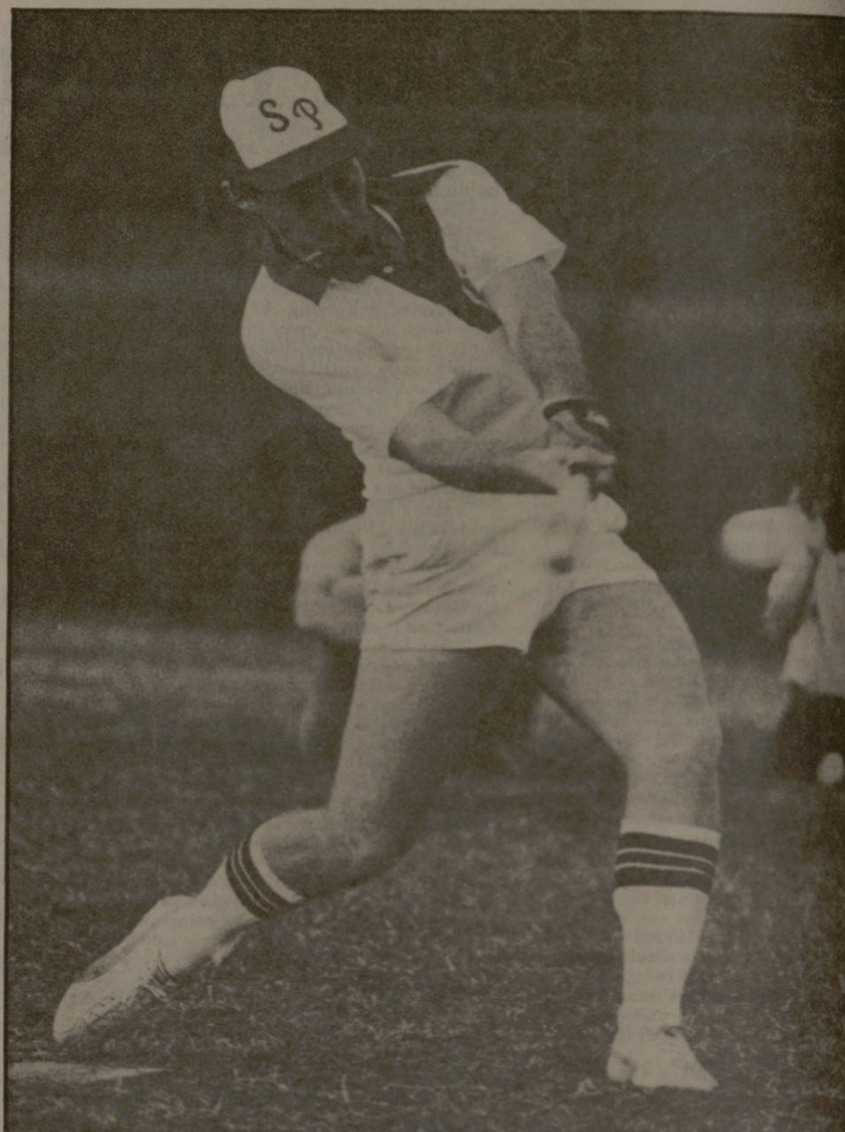
Game winning connection

"Bum always told me to stick around because we were Super Bowl contenders, but I look around now, and on paper, they're not Super Bowl contenders. I felt the Oilers had the talent the last three years to win the Super Bowl, but financially I really don't think they were trying to."