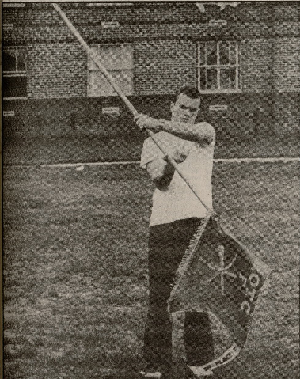
Flag waving practice