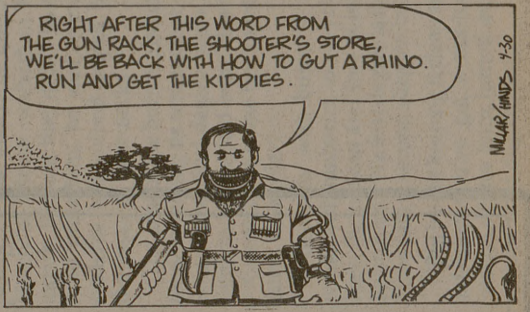
RIGHT AFTER THIS WORD FROM THE GUN RACK, THE SHOOTER'S STORE, WE'LL BE BACK WITH HOW TO GUT A RHINO. RUN AND GET THE KIDDIES.