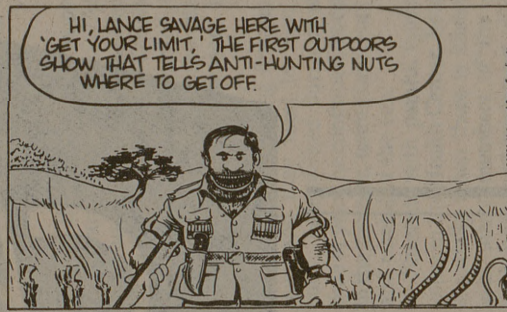
HI, LANCE SAVAGE HERE WITH 'GET YOUR LIMIT.' THE FIRST OUTDOORS SHOW THAT TELLS ANTI-HUNTING NUTS WHERE TO GET OFF.