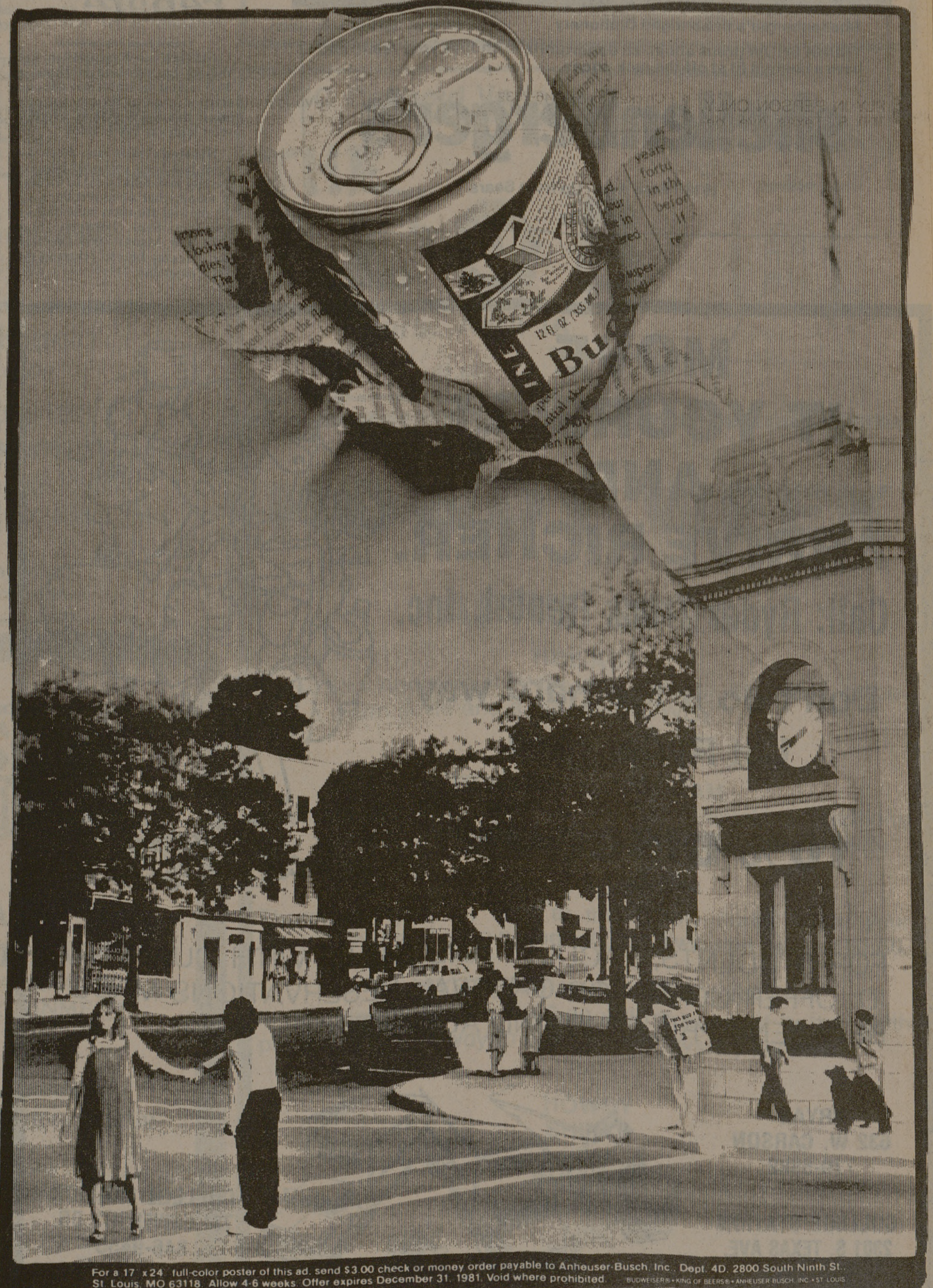
For a 17" x 24" full-color poster of this ad, send $3.00 check or money order payable to Anheuser-Busch, Inc., Dept. 4D, 2800 South Ninth St., St. Louis, MO 63118. Allow 4-6 weeks. Offer expires December 31, 1981. Void where prohibited. BUDWEISER® KING OF BEERS® ANHEUSER-BUSCH, INC. ST. LOUIS