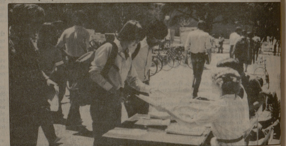
Students vote at Sbsia Dining Hall during Spring elections.

AGGIE TRADITIONS — The Student Services committee approved a plan to establish a one credit hour course for new students interested in learning about Aggie traditions. The plan was included in a housing bill presented