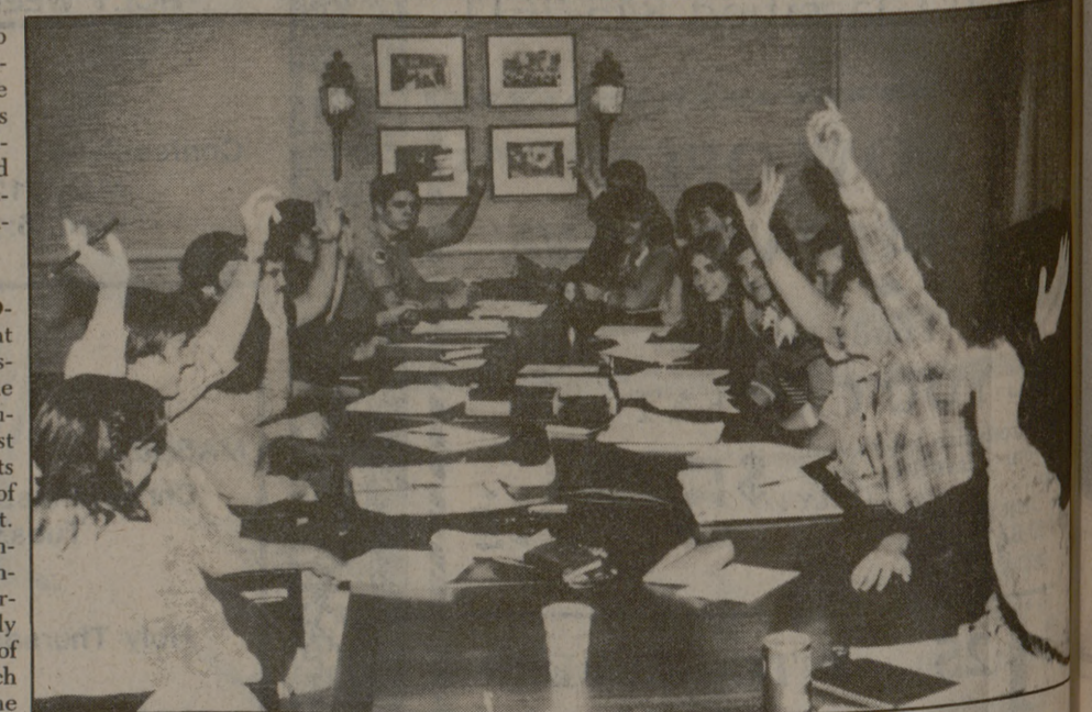
Committee members vote on upcoming legislation at a Student Services meeting.

to the Senate on February 18. The course would be arranged by the Department of Student Affairs, and may be offered as soon as the Fall of '81.