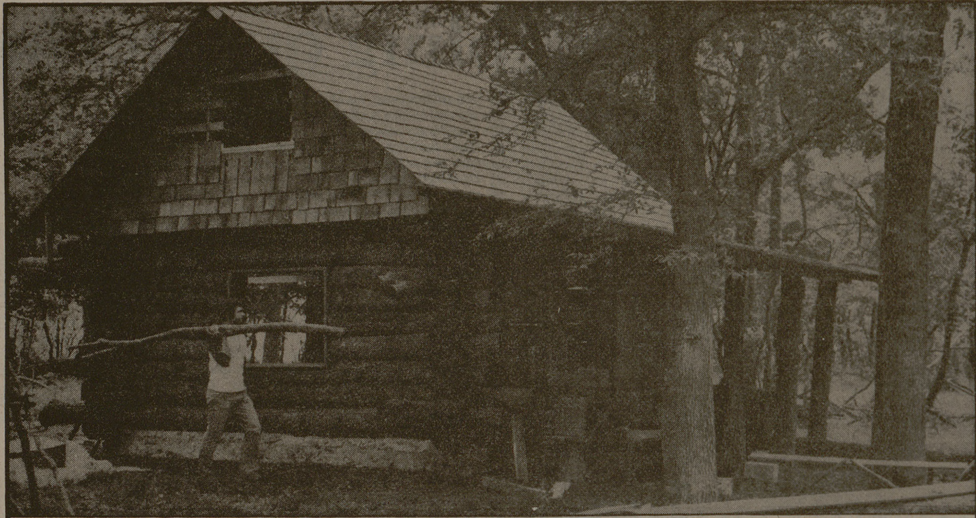
I'm a lumberjack ...