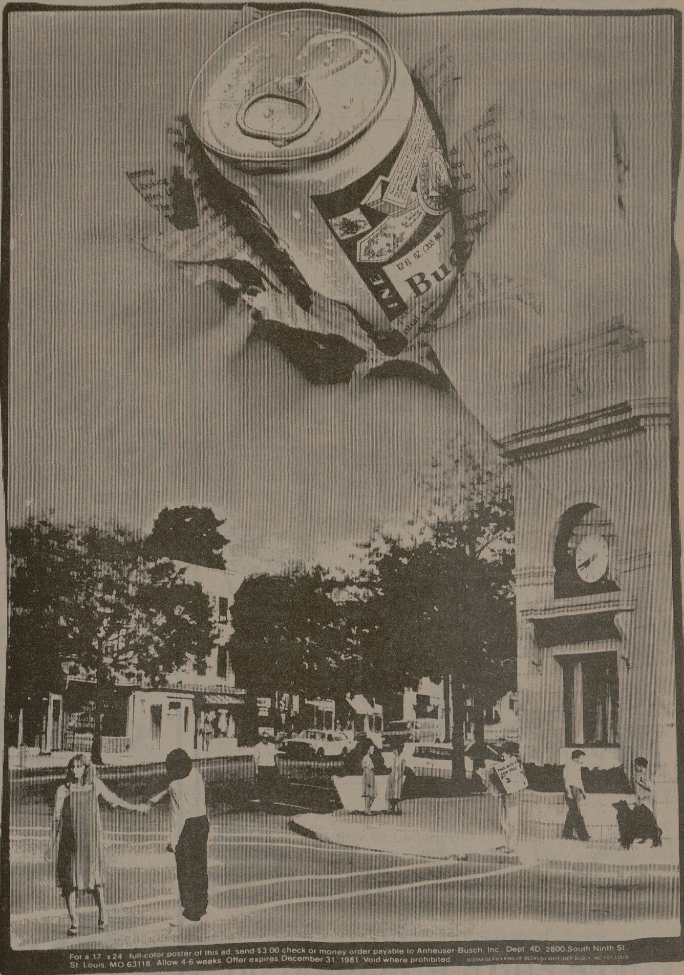
For a 17" x 24" full-color poster of this ad, send $3.00 check or money order payable to Anheuser-Busch, Inc., Dept. 4D, 2800 South Ninth St., St. Louis, MO 63118. Allow 4-6 weeks. Offer expires December 31, 1981. Void where prohibited.