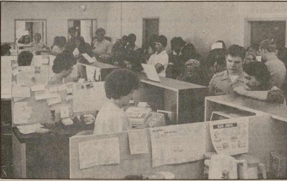
Friday means pay day and long lines at the Coke Building. Hundreds of students, faculty and staff form lines at the check cashing stations at Coke and Rudder Tower.