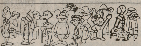
Day students get their news from the Batt.