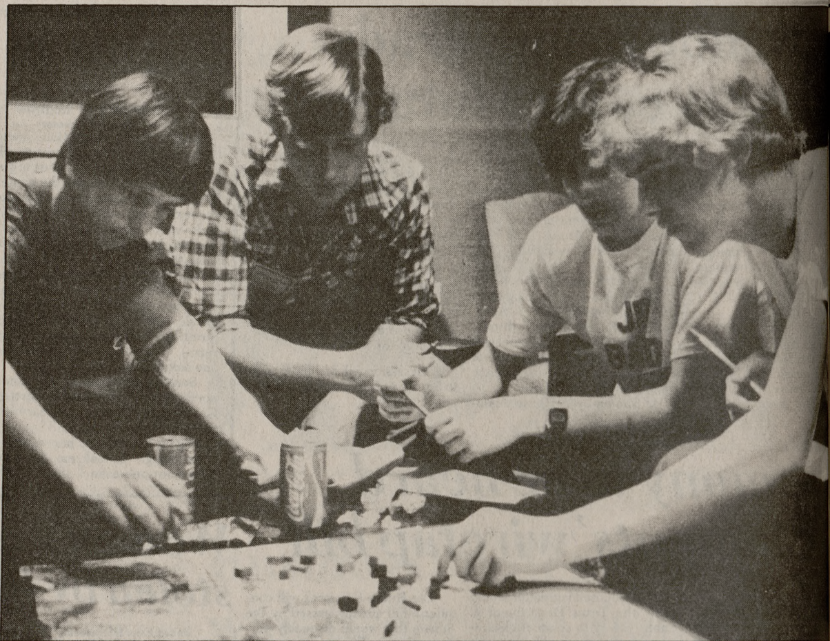
Next the world