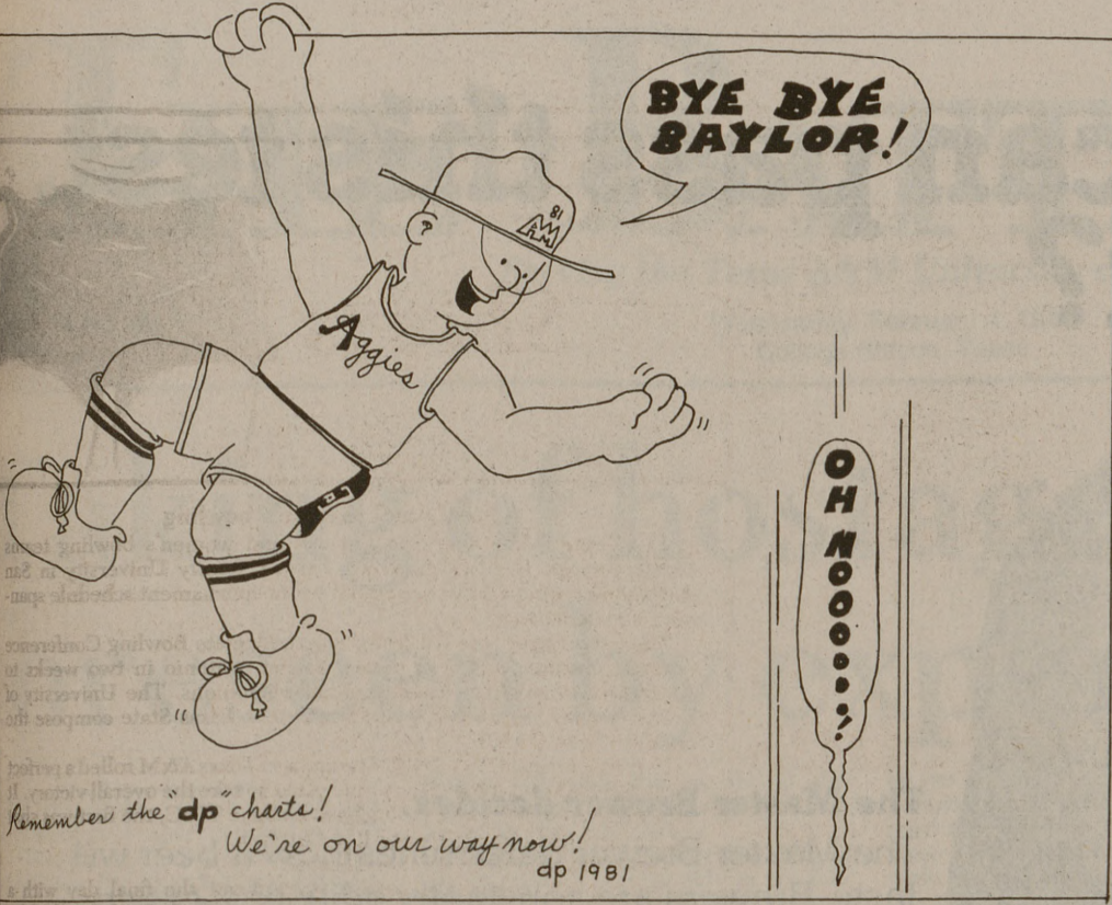
Remember the "dp" charts! We're on our way now! dp 1981