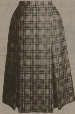
Tartan Plaid Skirts

We've found an incomparable velvet of soft pure cotton in deep rich colors. This is an ideal blazer for more formal occasions or to dress-up a casual outfit. Choose navy or forest green. $140.