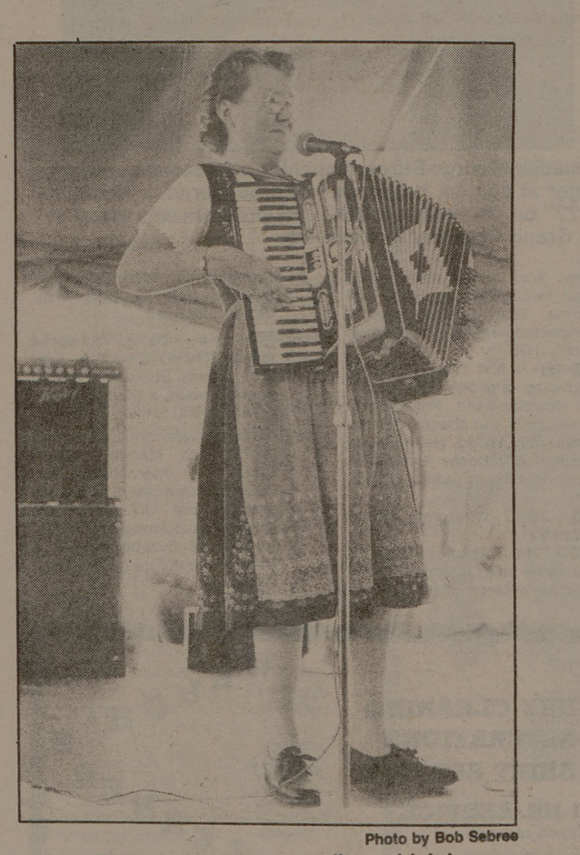
A woman plays the accordian, which is the backbone of the polka sound so pre-valent at Wurstfest.