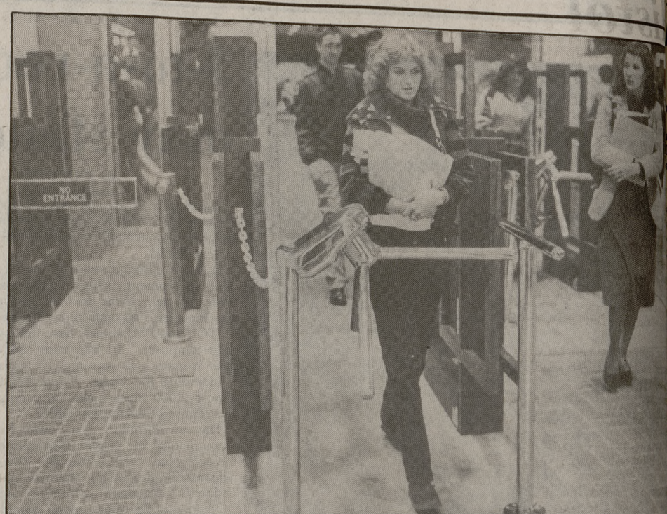
The security system at the Sterling C. Evans Library uses the magnetic detectors these students are walking through. Each book has a magnetic strip inside that is desensitized when