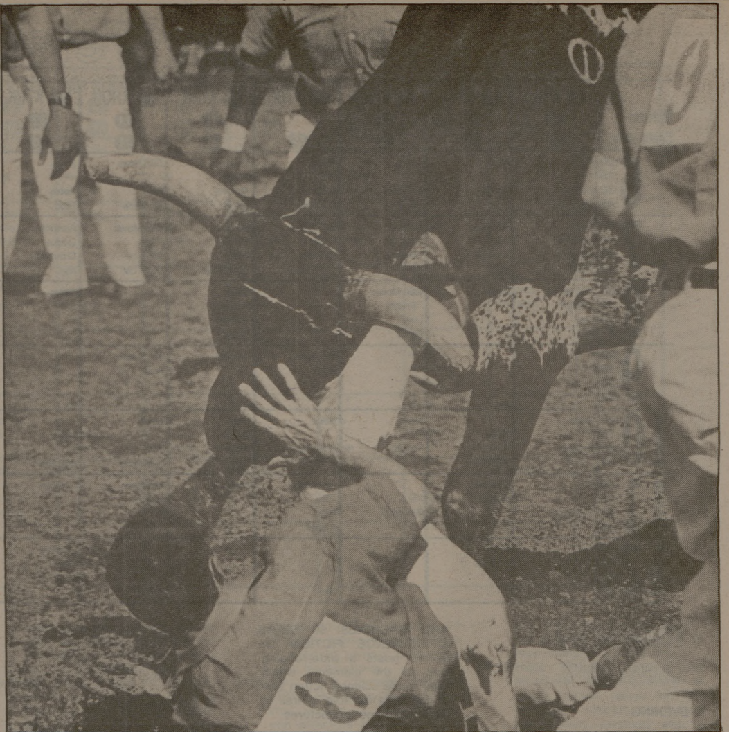
A red-shirt convict goes down under the horns of a Brahma bull during the Hard Money event. Forty red-shirts try to snatch the tobacco sack of cash tied between the bull's horns while the bull snatches red-shirts.