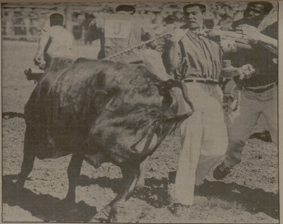
Wild cow milkers try to convince a very discontented cow that being milked isn't so bad.