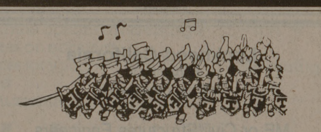
The band gets its news from the Batt.

Withdrawals within the first two contract years and withdrawals in excess of 10% made during the following six contract years are subject to a 5% charge. There is no charge on withdrawals of purchase payments held for at least eight years.