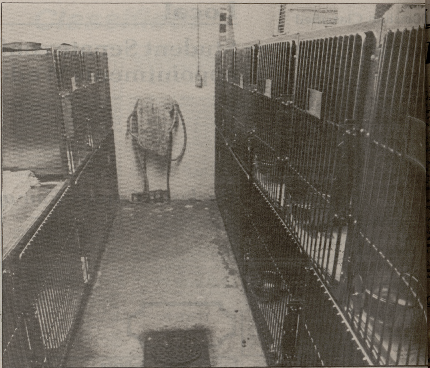
These cages represent temporary homes for any stray dogs picked up by the College Station dog catcher. The cages are

The Humane Society of the United States puts out recommendations for shelter sizes, and the size of this facility is based on those guidelines.