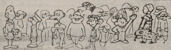
Day students get their news from the Batt.