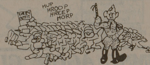
The Corps of Cadets gets its news from the Batt.