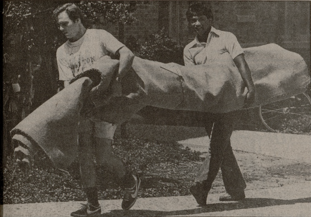
Lugging a rug

© 1980 Beer brewed in U.S.A. by Miller Brewing Company, Milwaukee, Wisconsin