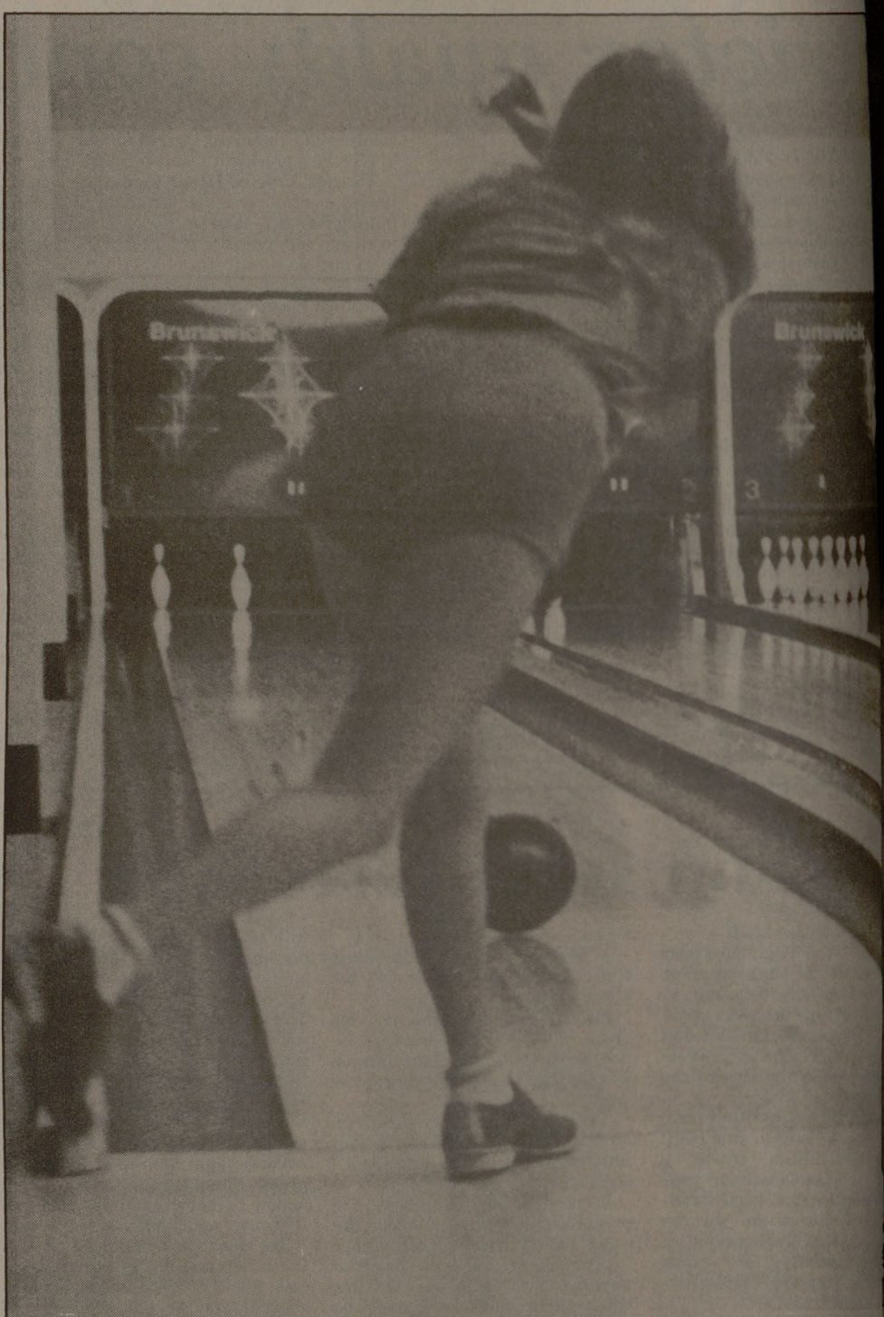
Knock 'em down

"It doesn't bother me at all," he said. "Curtis Dickey, Mike Mosley, and others have participated in track also. My philosophy is—if a person has that kind of ability, he should use it."