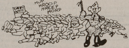
The Corps of Cadets gets its news from the Batt.

The co-op's regular hours are Monday and Wednesday from 9-11 a.m. and from 5-8:30 p.m.; Friday from 9-11 a.m., and Saturday from 9 a.m.-6 p.m.