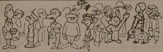
Day students get their news from the Batt.

Lewis said since there is a limited number of tickets, students should buy tickets as soon as possible.