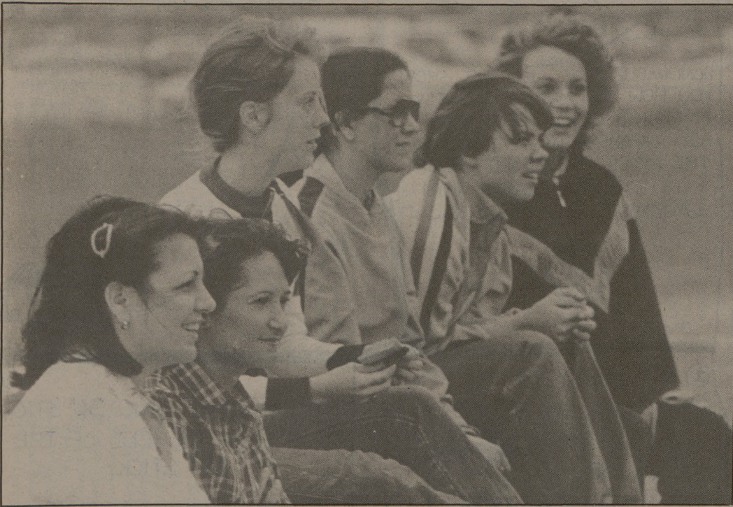
The cool wind blew, but loyal fans huddled to watch their teams during the softball tournament.