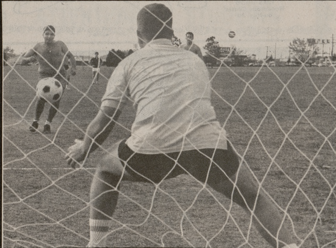
Goalie attempts to block a kick during an IM soccer match. The kick was one of three goals scored in the second half.