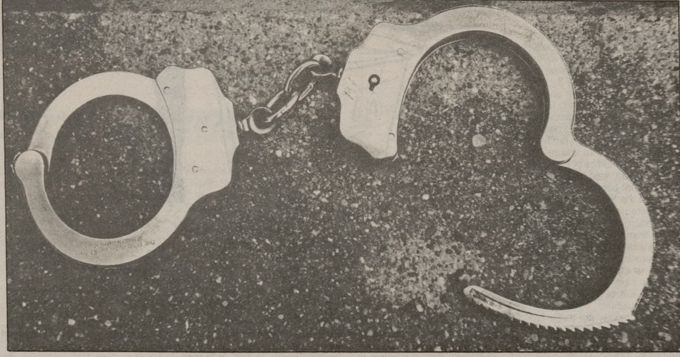
Handcuffs are one of the many types of security equipment that cadets must learn to handle effectively at the school.