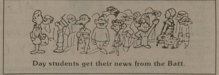
Day students get their news from the Batt.