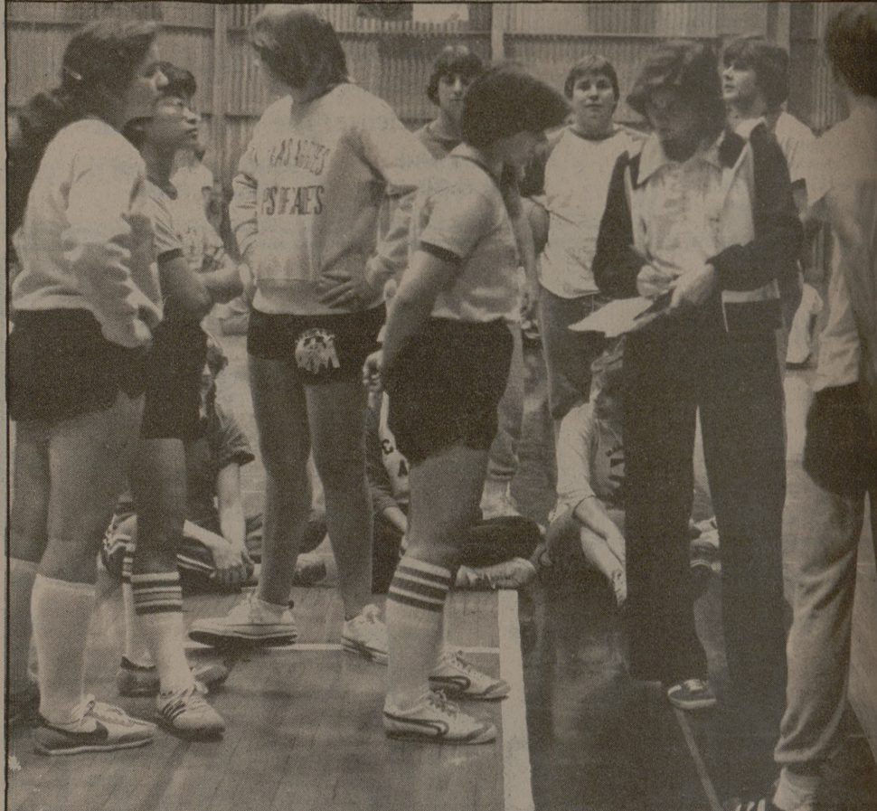
A crowd gathers anxious to see who will have the highest score in the free throw contest.