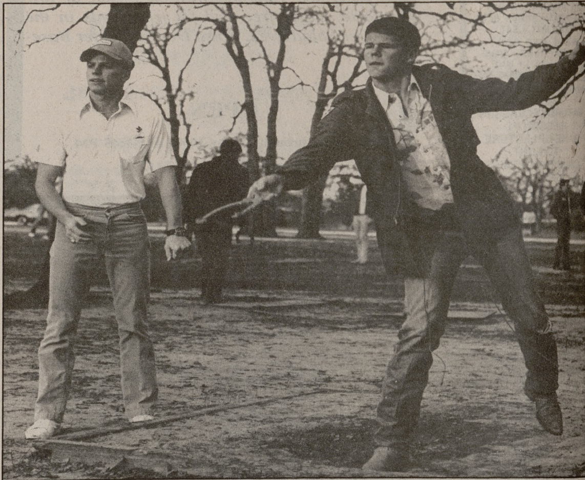
Entries for intramural Horseshoe Doubles competition open today.