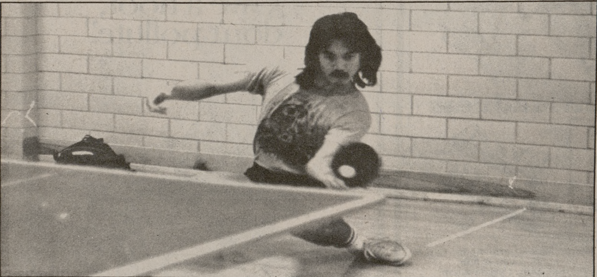
Table Tennis entries for this spring close Tuesday.