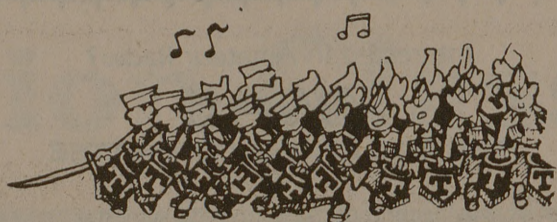
The band gets its news from the Batt.