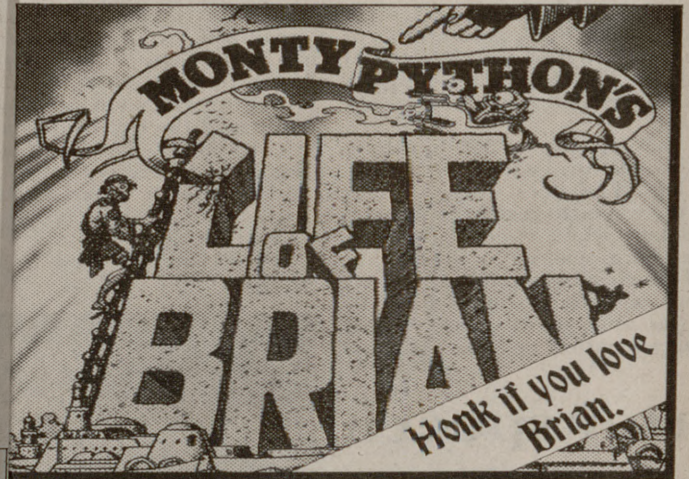
ORIGINAL TRACK AVAILABLE ON WARNER RECORDS & TAPE. READ THE BACK FROM FRED JORDAN BOOKS/GROSSET & DUNLAP. A WARNER BROS./ORION PICTURES RELEASE. THE WARNER BROS. & A Warner Communications Company. © 1979 WARNER BROS. PICTURES LTD. ALL RIGHTS RESERVED.