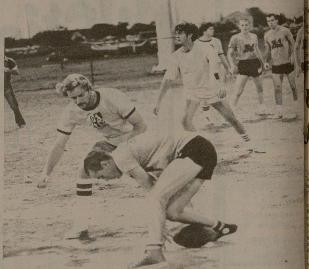
Football? Rugby? No, it's Flickerball, one of the more popular Intramural sports on the Texas A&M campus.