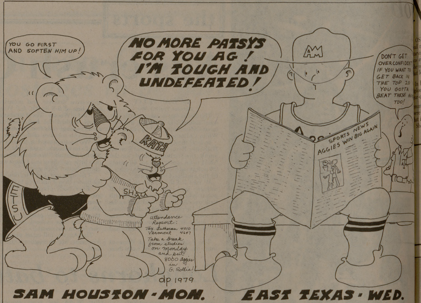
SAM HOUSTON - MON.