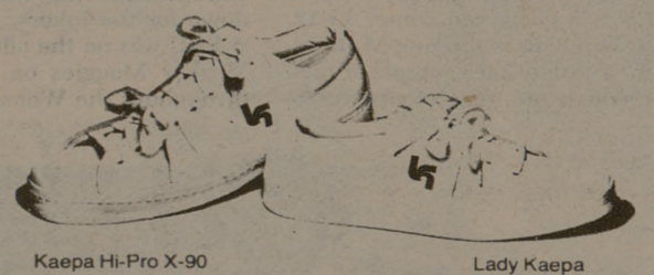
Kaepa Hi-Pro X-90