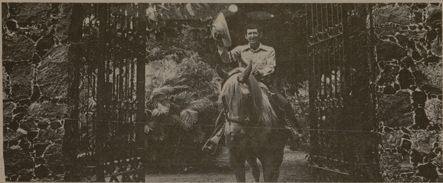
Next time you're in Mexico, stop by and visit the Cuervo fabrica in Tequila.

NAVY OFFICER PROGRAMS 1121 Walker St., Houston, Texas 77002 (713) 224-5897