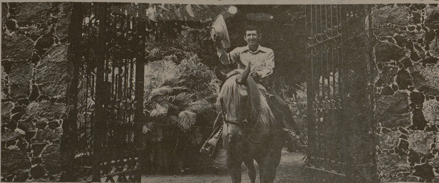
Next time you're in Mexico, stop by and visit the Cuervo fabrica in Tequila.

Since 1795 we've welcomed our guests with our best. A traditional taste of Cuervo Gold.