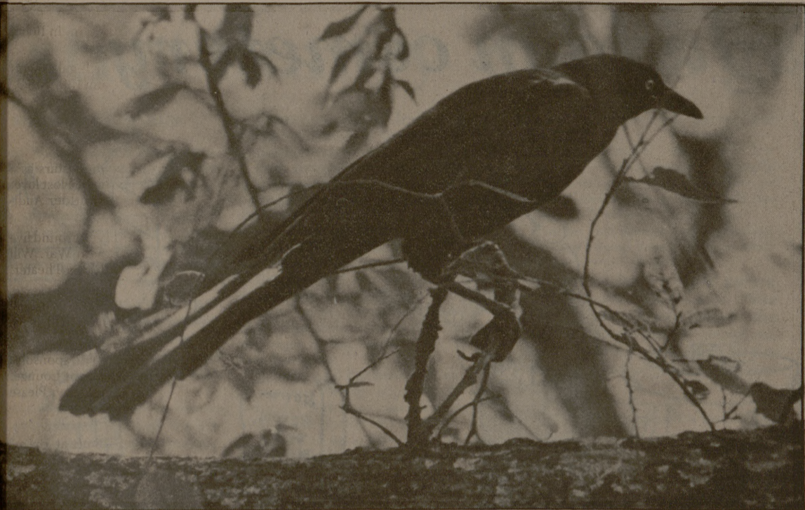
Although their voices are attractive and their appearance enjoyable, the birds on campus are creating a problem with the messes they leave due to their large numbers. This problem has even reached the extent that the maintenance department has to scare the birds out of their nesting sites.